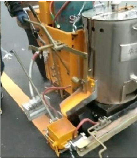
Horizontal line marking