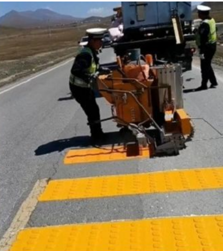
Convex line marking