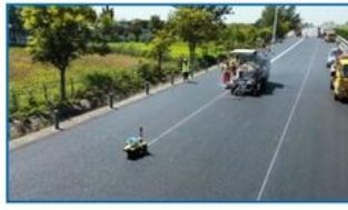
Expressways, National highways, Urban main roads