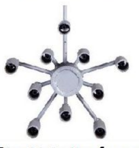
Direct injection furnace