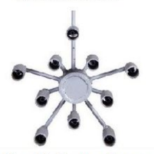
Direct injection furnace