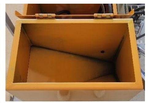
Paint Tank & Filter