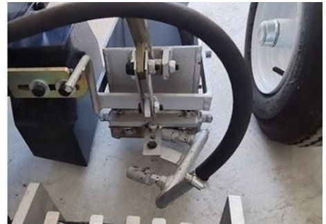
Glass beads Dispenser