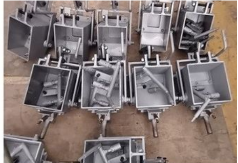
Different size marking shoes

The Marking shoes made by alloy material, It can keep marking the beautiful lines when the road is not flat. Simple structure, easy to disassemble, change and maintain. We have different size shoes to be chose, 10cm, 15cm, 20cm, 30cm, 40cm, 45cm or customed.