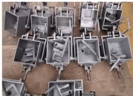
Different size marking shoes

The Marking shoes made by alloy material, It can keep marking the beautiful lines when the road is not flat. Simple structure , easy to disassemble, change and maintain. We have different size shoes to be chose, 10cm, 15cm, 20cm, 30cm, 40cm, 45cm or customized.