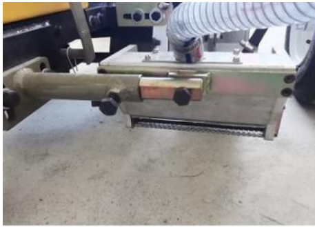
Glass beads Dispenser