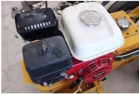
5.5 HP gasoline engine